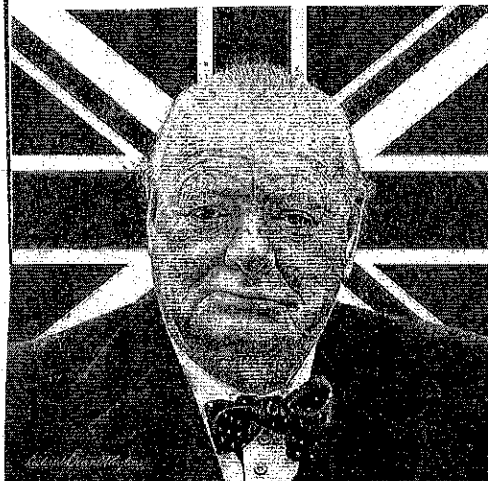
Winston Churchill Great Britain